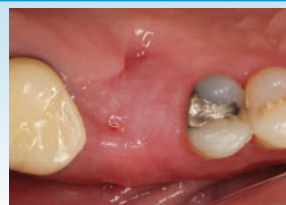
Figure D Two months postoperative. Excellent healing.

Clinical photos ©2013 Dr. El Chaar All rights reserved. Individual results may vary.