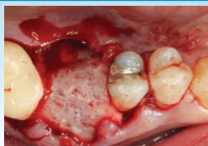
Figure B Copios Extend was laid over the graft and tacked under the flap.