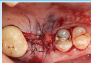
Figure C Flap sutured over the membrane.